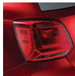
New tail lamps